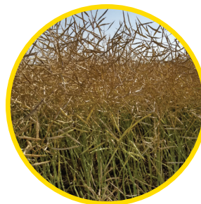
Green pods remain in this standing crop. More time is needed for further dry-down.