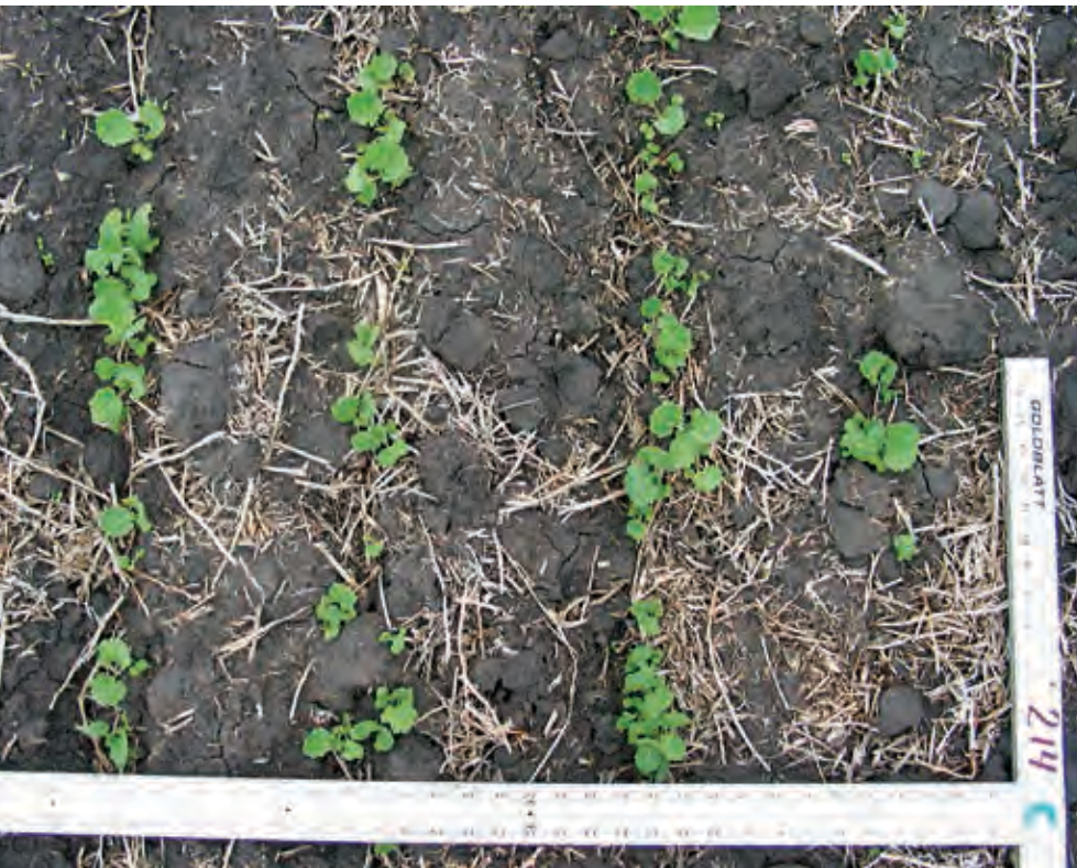
Significant increases in canola yield occurred on pea (shown here) and lentil residue at Beaverlodge, Indian Head, Swift Current and Brandon.

In the fall of 2009, total soil nitrate-N in the upper 60 cm was highest after fababean green manure in half of the sites, but it was not consistently higher after legume crops than after canola or wheat. However, when averaged across locations, fall nitrate levels were highest after fababean green manure and lowest after wheat. Effects of preceding crop on nitrate-N persisted through the following season of canola production to the fall of 2010. By 2011, after the production of a second crop, barley, significant effects of the crop grown in the first year of the study only occurred at Beaverlodge, where the fababean green manure still had higher soil nitrate levels than the other crops. ●